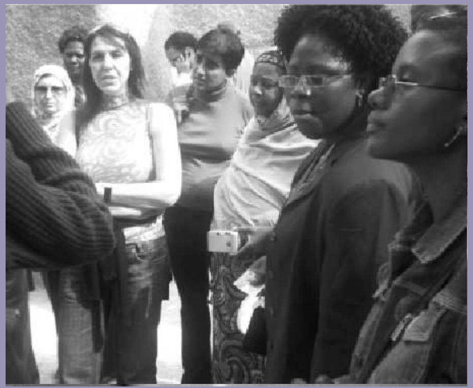
Some of the participants in the 2006 Sexuality Institute on Sexual and reproductive health and Rights in Marriage