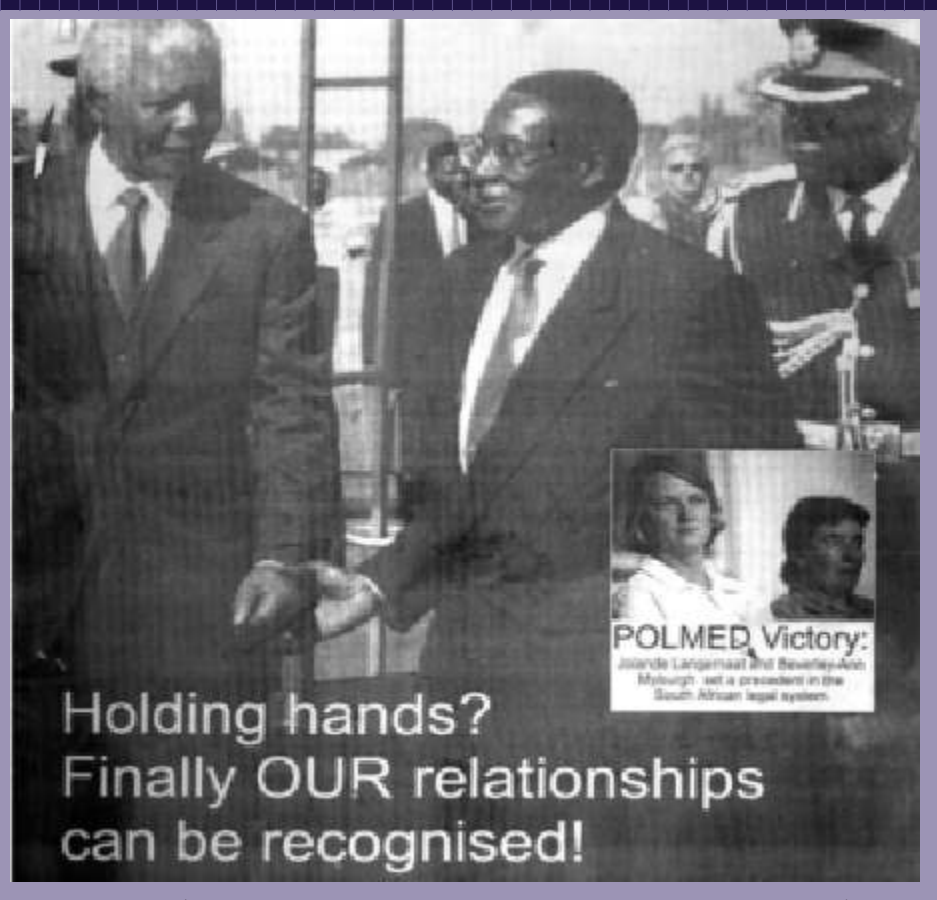
Copyright: Placard (KwaZulu-Natal Coalition for Gay & Lesbian Equality Picket Against Mugabe) in 1999 (image by the National Coalition for Gay and Lesbian Equality)