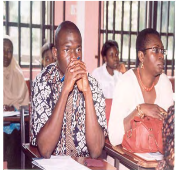
Serious moments of thinking and decision making-