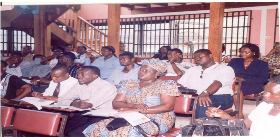
A mix of participants during the seminar immersed in the seminar

The importance of sexuality to humanity has made discussion, research, conferences, workshops and seminars in this field inevitable. In line with its tradition of organizing sexuality seminars, the Africa Regional Sexuality Resource Centre (ARSRC) – a project of Action Health Incorporated – organized the 2007 Understanding Human Sexuality Seminar in Nigeria at the Lady Bank Anthony Hall, University of Ibadan on the 13 th of September, 2007. The seminar is part of the ARSRC's public interdisciplinary dialogue on humane sexuality. The objectives of the dialogue are to provide a forum for healthy public debate on key sexuality issues and therefore bridge the gap between various sectors of the society (academicians, researchers, programmers, civil society and media professional), and generate knowledge of sexual health and rights from an African perspective.