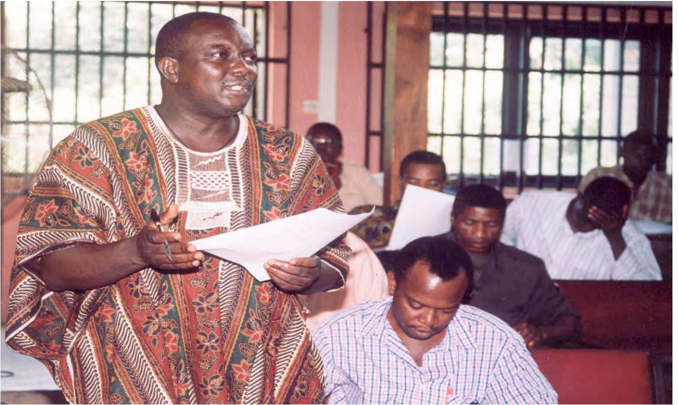
Participants so excited to ask questions (above) and make contributions (below)