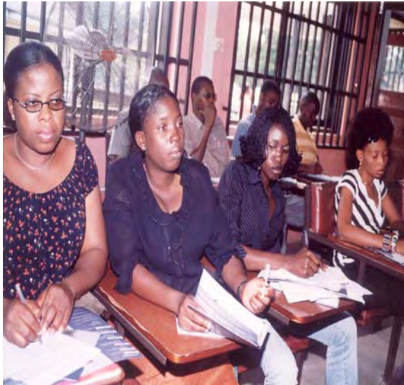
A cross section of participants paying keen attention to the presentations

sexuality expression, however, fantasy is the most common. It is also the means by which all others find meaning in an ambivalent world.